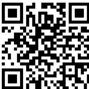
Manual(Word) Download QR Code