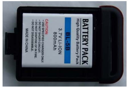
Install the battery like this.