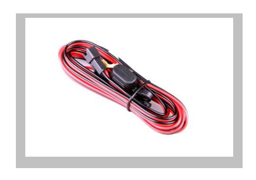
Charging cable (Standard)